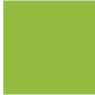
Green - GRN